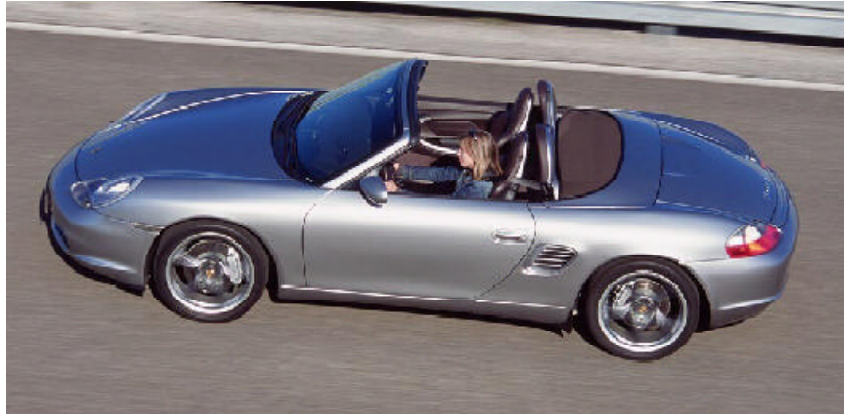
Porsche's Spyder Boxster S