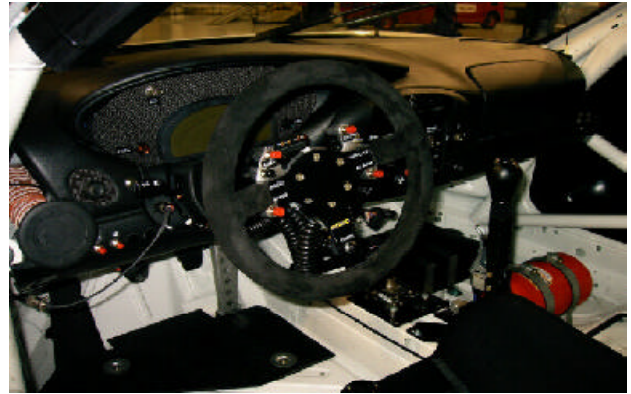
Interior of 911 GT3 RSR showing the sequential gear shift.

Both photos and story courtesy of Alex Job Racing